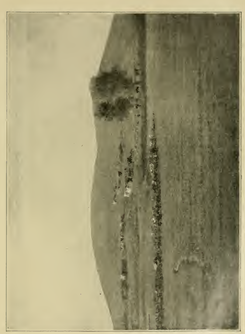
KHATYN SLRAH (LYSTRA). MOUND MARKING THE SITE OF THE CITY.